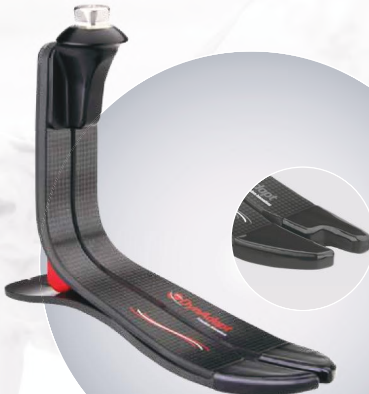
Freedom DynAdapt (F10)